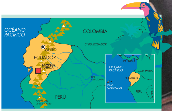
Mapa de Ecuador